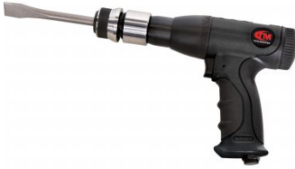
A039 Air Hammer Chisel - Vibration Damped