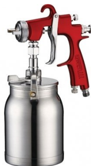
S320 Suction Spray Gun & Pot