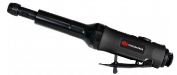
A041 Air Die Grinder - Extended Shaft 5" (127mm)