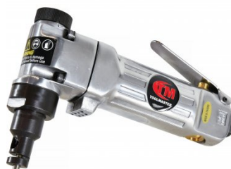
A082 Air Nibbler