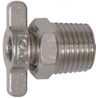
A242 Air Fittings