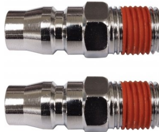
F951 High-Flow Air Fittings