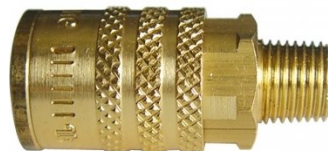
F901 Air Fittings