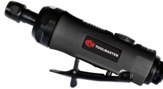
A040 Air Die Grinder