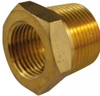
F842 Air Fittings