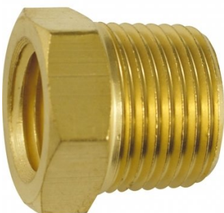
F832 Air Fittings