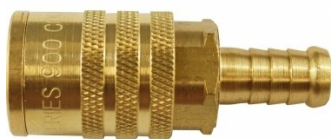
F912 Air Fittings