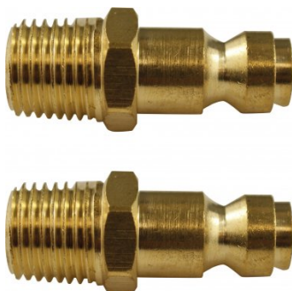
F902B Air Fittings