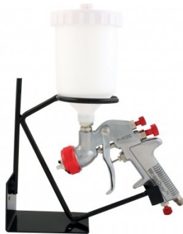
S326 Gravity Feed - Spray Gun