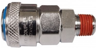
F941 High-Flow One Touch System Air Fittings