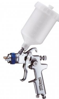
S317 Gravity Feed - Spray Gun