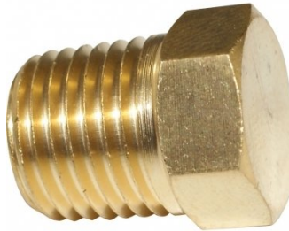
F870 Air Fittings