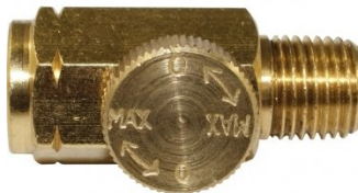
A219 Air Fittings