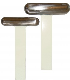
S2231 Straight Steel T-Dolly Set Large - 2 Piece