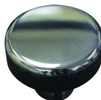
B8972 Doming Bottom Die