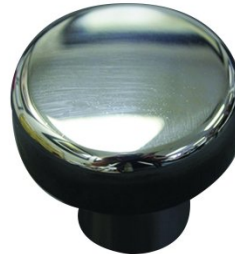
B8968 Doming Bottom Die