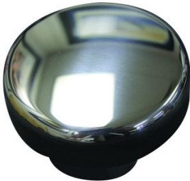
B8963 Doming Bottom Die