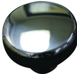
B8965 Doming Bottom Die