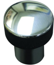
B8961 Doming Bottom Die