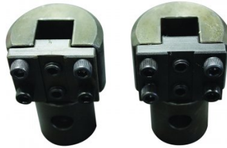
B90502 3/4" Universal Tool Holder - Square Tool Holder