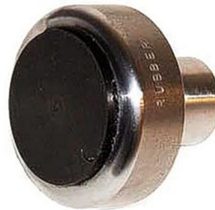
B9060 Rubber Top Die