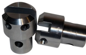
B9050 1/2" Universal Tool Holder - Flat Bar Holder