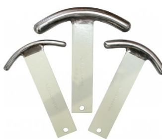
S2233 Curved Steel Dolly Set - 3 Piece