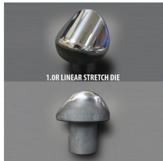
B9058 1" Radius - 2.5" Linear Stretch Die