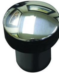
B8960 Doming Bottom Die