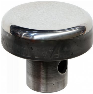
B8957 Master Flat Top Die