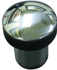
B8959 Doming Bottom Die