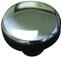
B8973 Stretch Flat Bottom Die