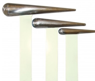
S2232 Tapered Steel T-Dolly Set - 3 Piece