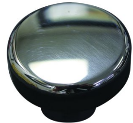
B8967 Doming Bottom Die