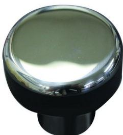
B8970 Doming Bottom Die