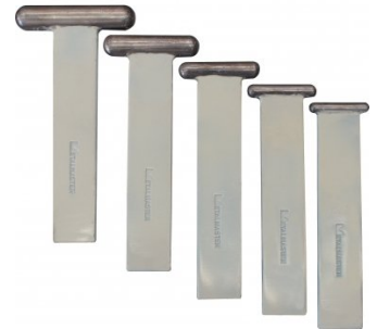
S223 Straight Steel T-Dolly Set Small - 5 Piece