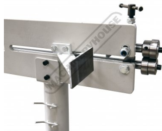
Left Side View Mounted On Machine