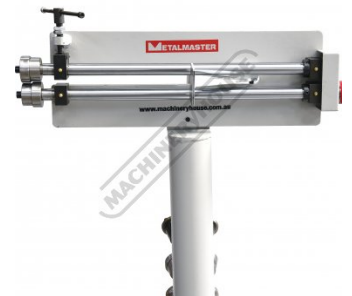
Adjusted To The Rear