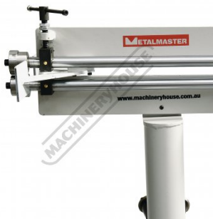
Adjusted To The Front