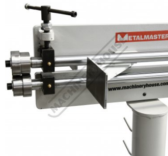
Right Side View Mounted On Machine