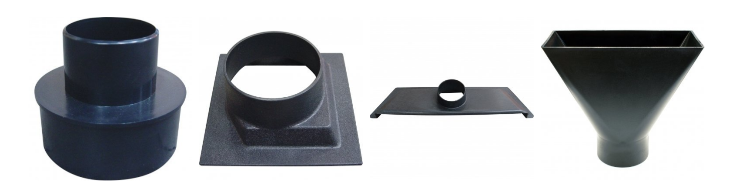
W338B Wood Lathe - Dust Chute - Big Gulp