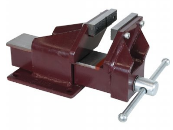
V069 Steel Offset Fabricated Bench Vice - Right Hand