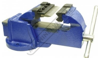
Shown Set Up on a Vice