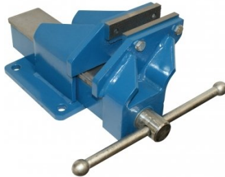
V0914 Steel Offset Fabricated Bench Vice - Right Hand