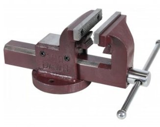
V081 Forge Steel Utility Bench Vice with Anvil & Pipe Jaws