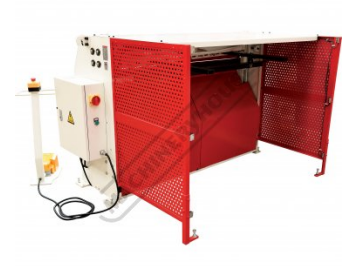
Rear Left View