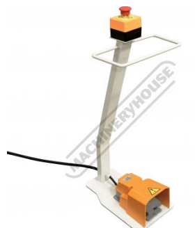
Emergency Stop On Roving Foot Pedal Roving Foot Pedal