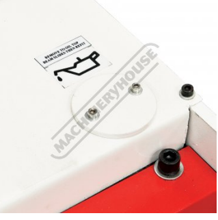
Top Beam Oil Access