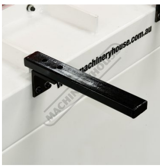
Front Sheet Supports