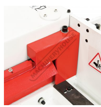
Material Clamp Bar Guard