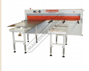
Isolation Switch and Rear Guard Reset Button Shown with Optional Ball Transfer Tables