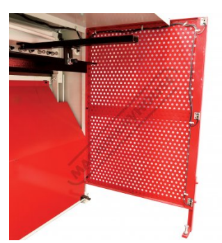
3 x Rear Safety Photoelectric Sensors Safety Photoelectric Sensor