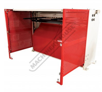
Rear Right View