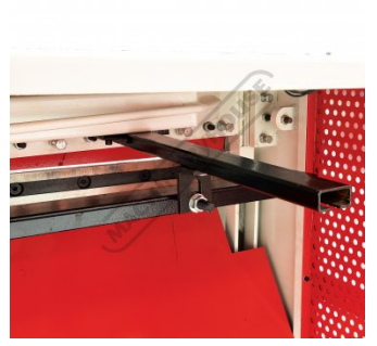
Rear Back Gauge