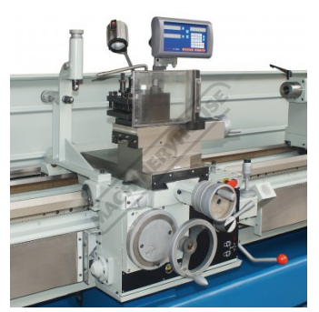
Saddle Left View