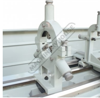
3 Point Fixed Steady