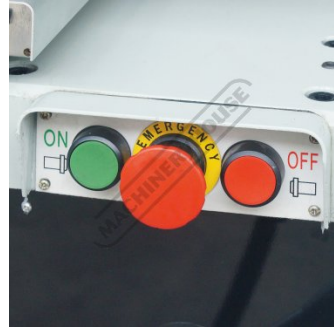
Power Control Panel On Saddle