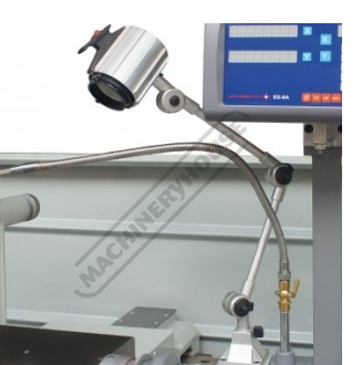
Coolant Nozzle And Worklight