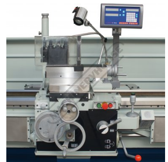
Saddle Front View