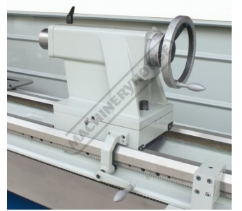
Tailstock Rear View