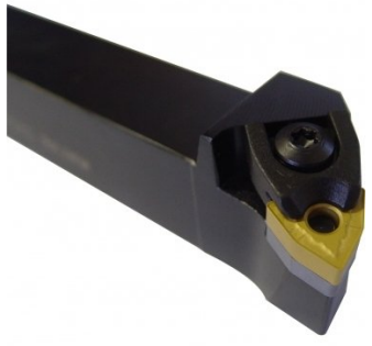
L467 Professional Lathe Parting Tool Kit - Insert Type