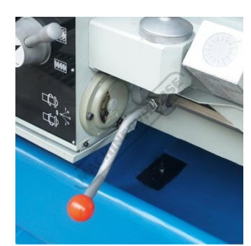
Spindle Engage Lever