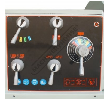
Spindle Speed Controls