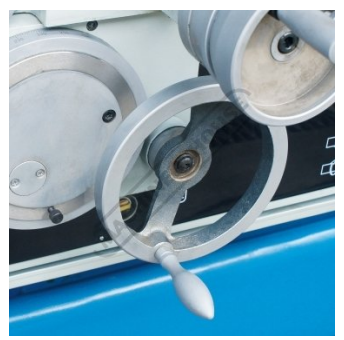
Saddle Hand Wheel