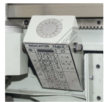
Thread Chasing Dial