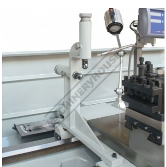
2 Point Travelling Steady