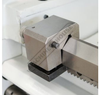
Micro Adjustable Saddle Stop