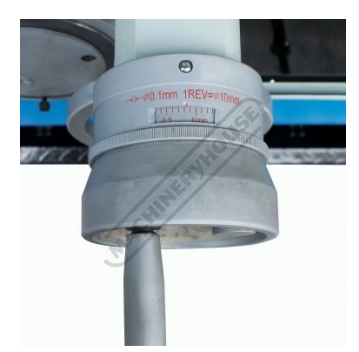
Cross Slide Dial