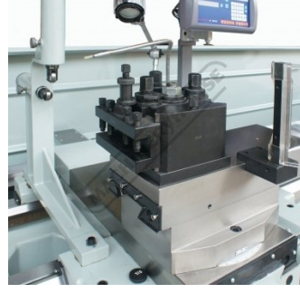
Taper Turning Attachment