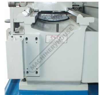
Ground and Hardened Bed