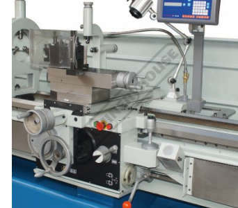
Saddle Right View