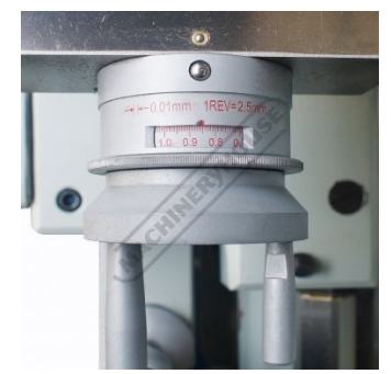
Compound Slide Dial

sales@machineryhouse.com.au www.machineryhouse.com.au