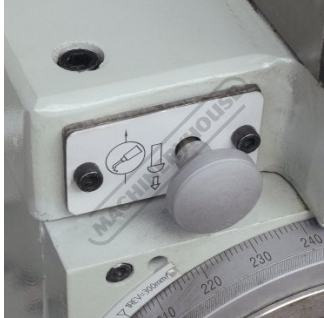
One Shot Lubrication