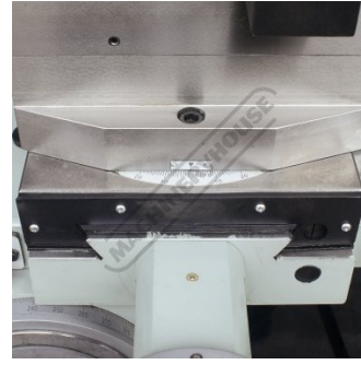
Compound Slide Angle Scale