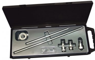
C660 Plasma Circle Cutting Kit