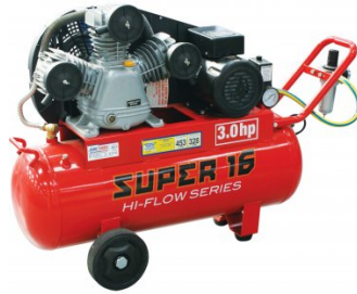
C342 Air Compressor