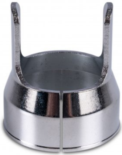
C596 Stand-off Guide