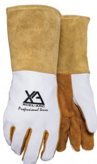
W101 TIG Welding Gloves - 310mm