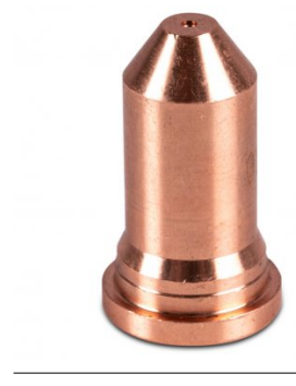
02/07/2023 7:16 AM