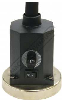
Brightness Dimmer Control