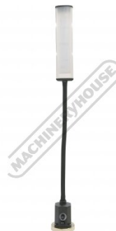
Shown in Vertical Position