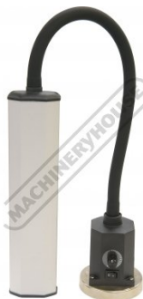
Flexible Shown Bent Down