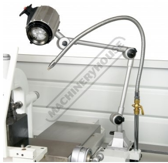
LED Worklight and Coolant Hose