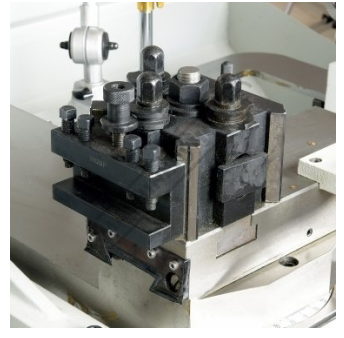
Quick Change Toolpost