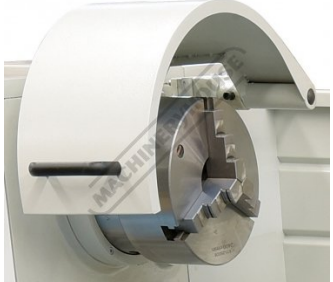
Safety Chuck Guard