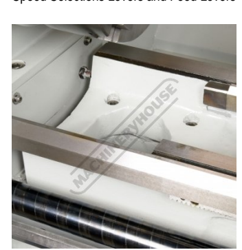
Removable Gap Bedway