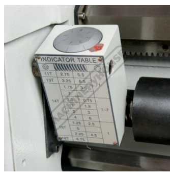
Thread Chasing Dial