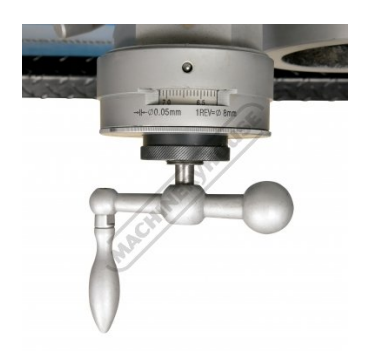
Cross Feed Dial in Metric Mode

sales@machineryhouse.com.au www.machineryhouse.com.au