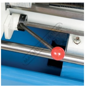
Spindle Engagement Lever