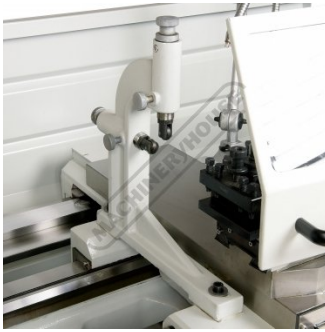
Travelling Steady with Roller Guides