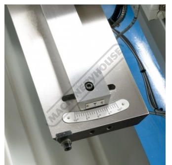
Taper Turning Attachment Close Up