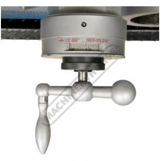
Cross Feed Dial in Imperial Mode