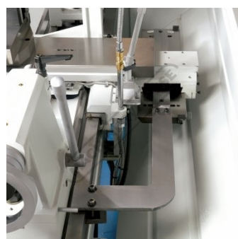
Taper Turning Attachment View 2