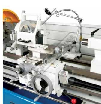
Saddle Right View