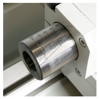
Tailstock Quill Graduations