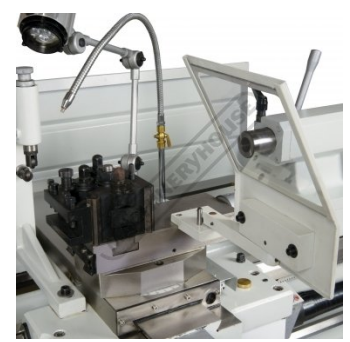
Saddle Safety Guard Shown Open