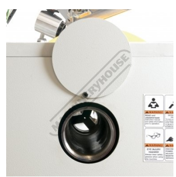
80mm Spindle Bore