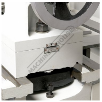
Tailstock with Horizontal Adjustment Tailstock Dial in Metric