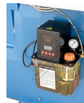
Automatic Lubrication System