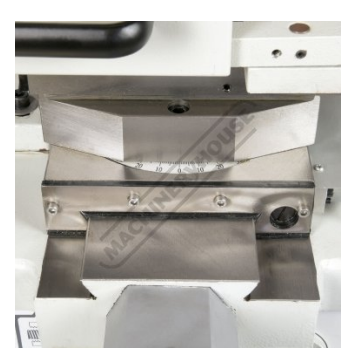
Compound Angle Scale