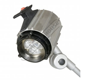
LED Worklight Close Up