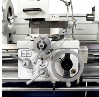
Saddle Front View