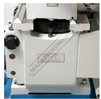
Hardened and Ground Bed

sales@machineryhouse.com.au www.machineryhouse.com.au