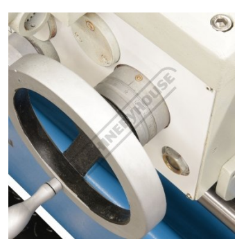
Saddle Dial In Metric