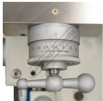
Compound Slide Dial in Metric