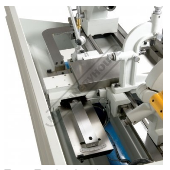
Taper Turning Attachment