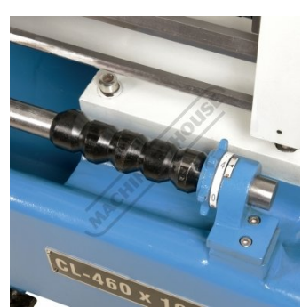
5 Position Adjustable Length Stop