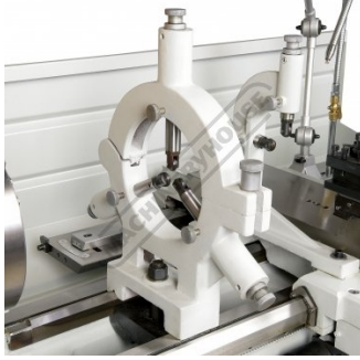
Fixed Steady with Roller Guides