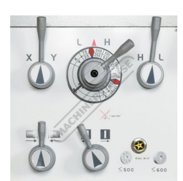
Speed Selections Levers and Feed Levers