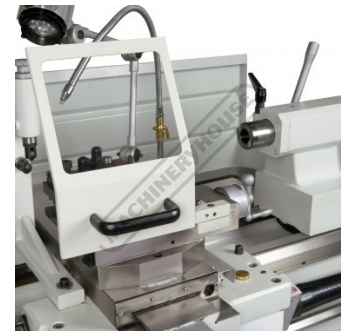
Saddle Safety Guard