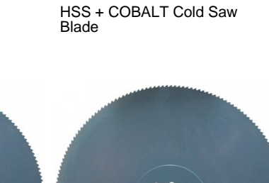
S137C HSS + COBALT Cold Saw