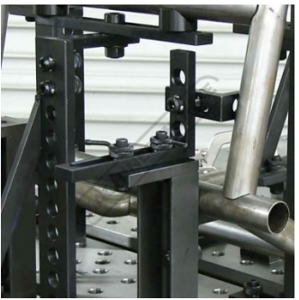
Ball Lock Bolts are an essential component in modular fixturing When engaged dightered three steel locking balls move outward to box undermeath the table Use Ball Lock Bolts basen elements to the babletop or to economy damping squares or right angle brackets Efficient way of fastening fixture elements