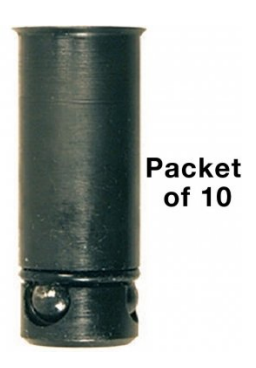
W08049 BuildPro Ball Lock Bolt