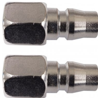
F955 High-Flow Air Fittings