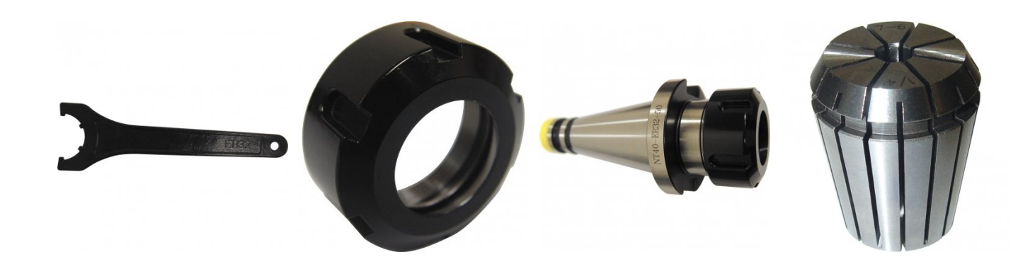
C907 ER32 Collet