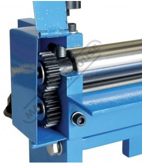
Gear Driven Rolls