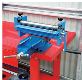
Shown Mounted in Optional Vice Right View