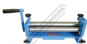
Rear Top View