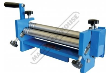
Rear Right View