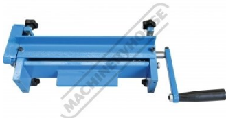
Bench or Vice Mount