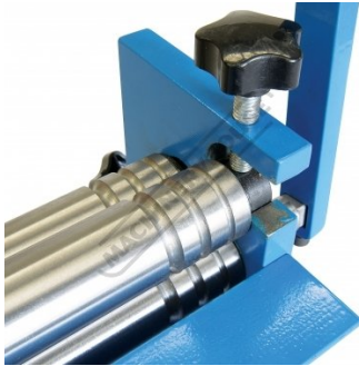
Wire Groove Rolls