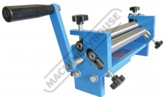
Rear Left View