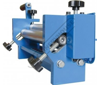
Adjustable Rear Roller