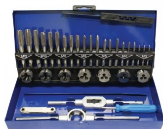
T013 Metric HSS Tap & Die Set - 32 Piece