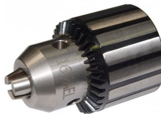
C292 Industrial Drill Chuck - Keyless Type