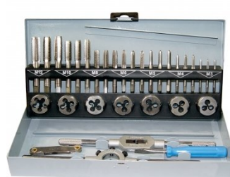
T014 Metric Alloy Steel Tap & Die Set - 45 Piece