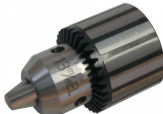
C290 Heavy Duty Drill Chuck - Keyed Type