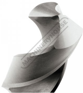
118 Degree Standard Point