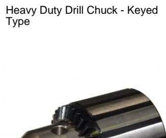
C289 Heavy Duty Drill Chuck - Keyed Type