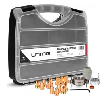
C624 0.9mm Cutting Tips