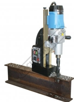
Drilling I Beam with 3MT Taper Shank Drill