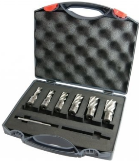
D109 HSS Broach Drill Set - 6 Piece