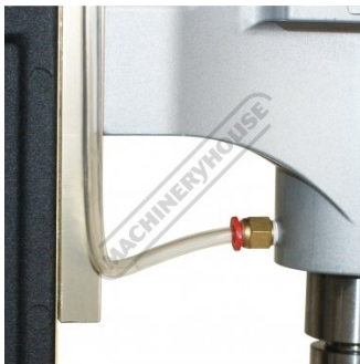
Through Spindle Coolant System