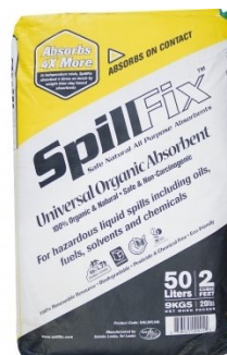
O000 SpillFix Universal Organic Absorbent