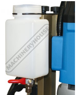
Coolant Storage Container with Valve