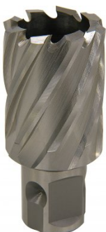
D9528 HSS Drill Broach Cutter