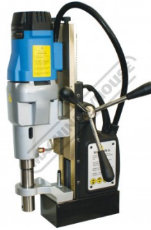
Rear Front View