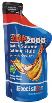
S090A Soluble Metal Cutting Fluid - 1 Litre