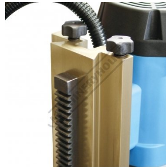
Dovetail Bronze Slide