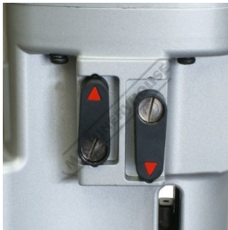
Four Speed Gearbox Levers