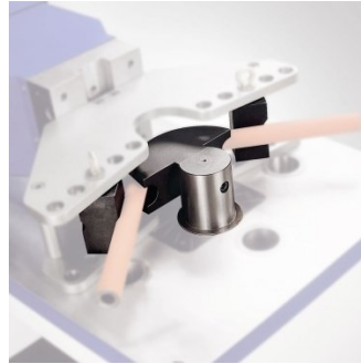
P1602 3/8" Pipe Bender Former Set