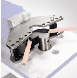
P1601 Pipe Bender Attachment