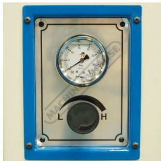
Pressure Adjustment Dial and Gauge