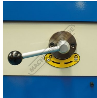
Main Post Release Lock Lever