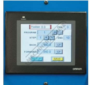
Touch Screen NC Control