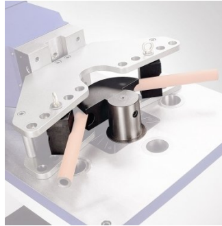
P1603 1/2" Pipe Bender Former Set