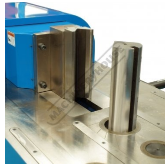
Hydraulic Horizontal Press