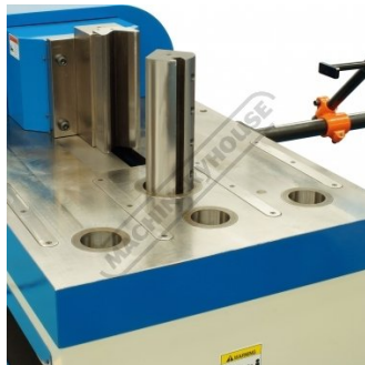
Table with Posts Removed for Optional Attachments