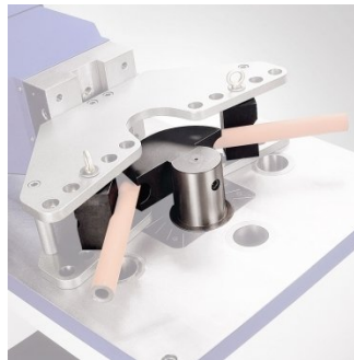
P1607 1-1/2" Pipe Bender Former Set