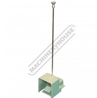
Roving Foot Pedal