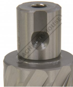
Universal Shank Rear Side