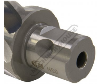
Universal Shank Rear View