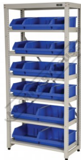
Shown with optional bucket storage