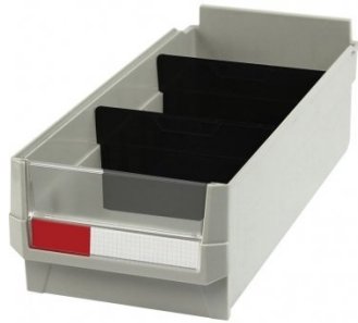
S028 Plastic Storage Bin