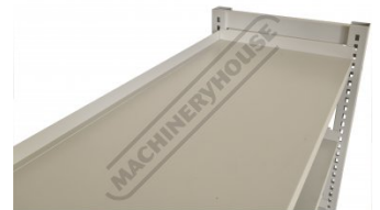
30mm return on the rear of each shelf