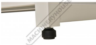
Adjustable leveling feet