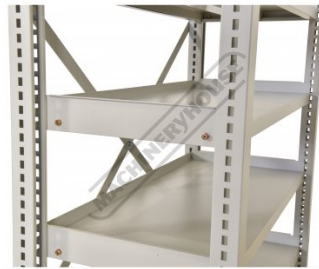
Bolts to secure shelf