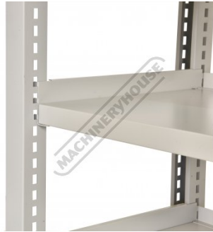
Adjustable shelf brackets