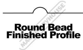
Round Bead Finished Profile