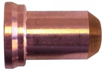
C625 1.0mm Cutting Tips