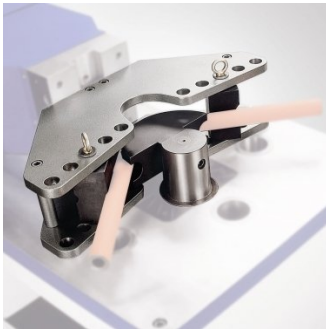
P1600 Pipe Bender Attachment