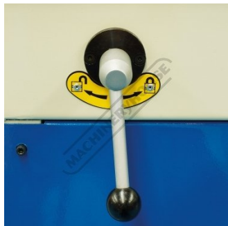
Main Post Release Lock Lever