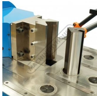
Hydraulic Horizontal Press