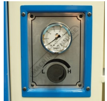
Pressure Adjustment Dial and Gauge