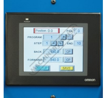
Touch Screen NC Control