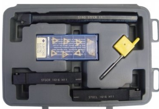
L452 Lathe Turning Tool Kit - 3 piece Insert Type