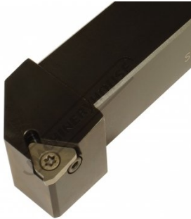
Toolholder Close Up