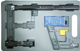
L459 Lathe Threading Tool Kit - Insert Type