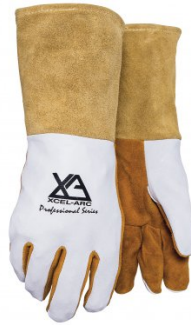
W101 TIG Welding Gloves - 310mm