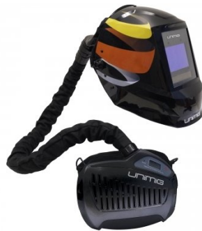
W159 Auto Darken Welding Helmet with PAPR Respiratory System - 5-9, 9-13 Shade