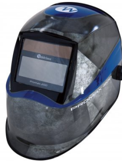
W001 Auto Darken Welding Helmet - 9~13 Shade