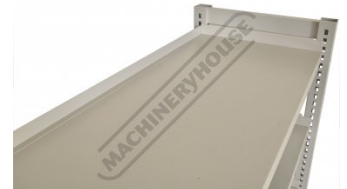
30mm return on the rear of each shelf