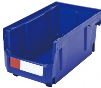
S031 Plastic Storage Bucket