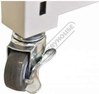
Swivel casto with brake