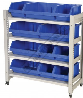
Shown with optional bucket storage