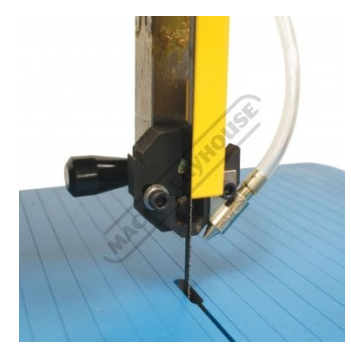
Blade Air Pump