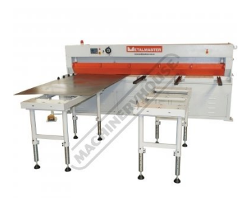
Shown with Optional Ball Transfer Tables - Order Code (L840)