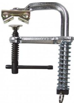
W07971 BuildPro Magspring Clamp