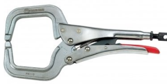
W1016 Locking C-Clamp - Round Tip