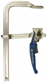
C0012 Ratchet F Clamp