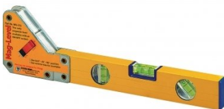
W1020 Magnetic Level