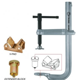
W1026 4 In One Utility Clamping System