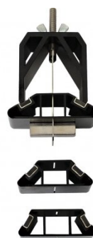
W114 3 Angles Welding Aluminium Clamp Set