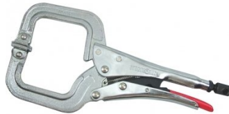
W1018 Locking C-Clamp - Swivel Tip