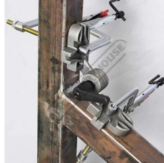
Shown Clamping RHS Steel At Angle