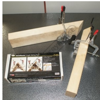
Shown Clamping Wood Swiveling Open