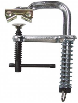
W07970 BuildPro Magspring Clamp