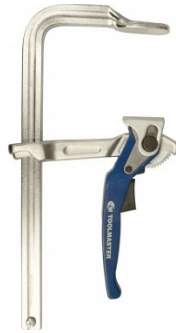
C0013 Ratchet F Clamp