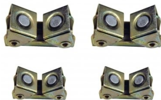
W1021 Magnetic V-Pad Kit - (4 Pack)