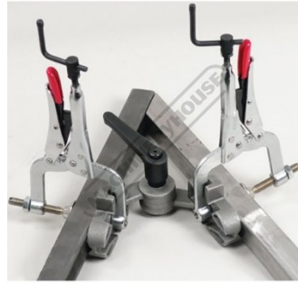
Shown Clamping RHS Steel