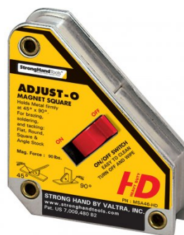
W1007 Adjust-O Magnet Square - Heavy Duty