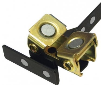
W1022 MagTab Magnet