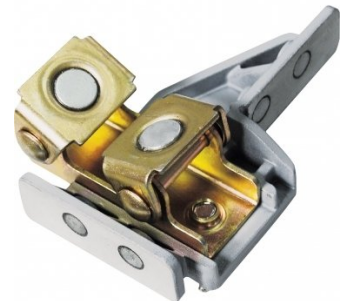
W1023 MagTab AL Magnet