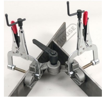
Shown Clamping Flat Steel At Angle