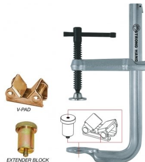
W1027 4 In One Utility Clamping System