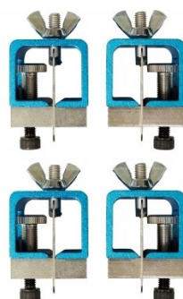
W113 Butt Welding Aluminium & Steel Clamp Set