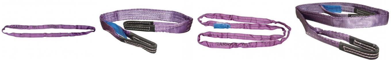
H308 Round Sling