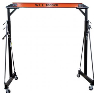
C188 Mobile Girder Rail Gantry