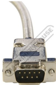
DSub9 Male Plug