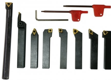
L0099 Lathe Turning Tool Kit - 7 piece Insert Type