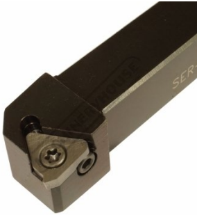
Toolholder Close Up