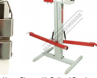
Shrinker And Stretcher Close Up