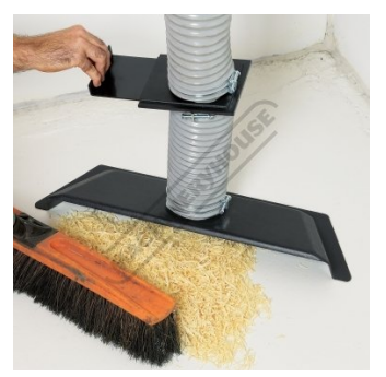
Action Shot Shown with Optional Shut Off Valve