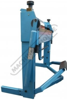
Apron Open Position