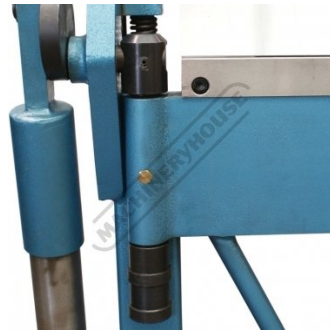
Apron Height Adjustment