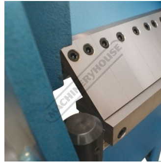
Individual Clamp Fingers