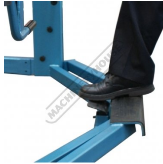
Foot Clamping Release Lock