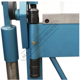
Apron Height Adjustment