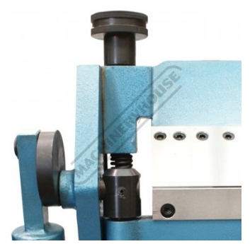
Material Clamping Tension Adjustment Dial