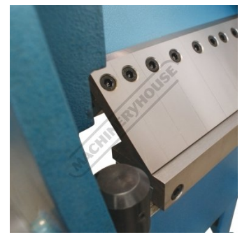
Individual Clamp Fingers