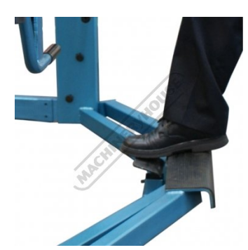
Foot Clamping Release Lock