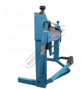
Apron Open Position