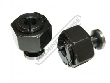
Includes 1/4" & 1/2" Collets