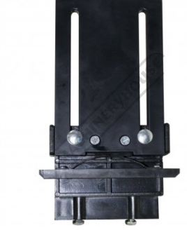
Top Clamp Rear View