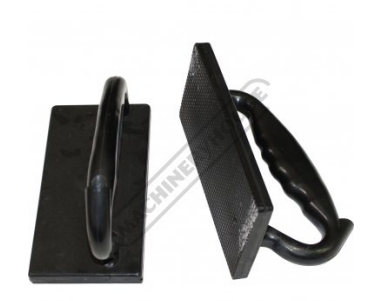
2 x Push Blocks