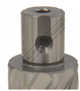
Universal Shank Rear Side