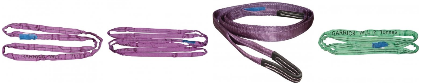
H310 Round Slings