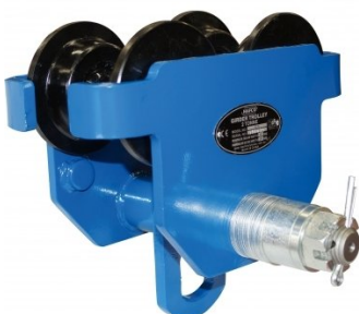
C148 Girder Trolley