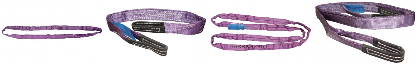
H308 Round Slings