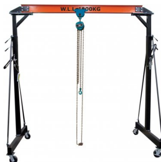
K088 Mobile Girder Rail Gantry Package Deal