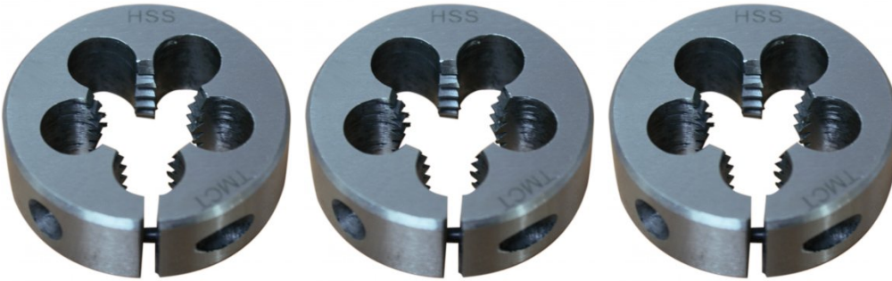
T944 HSS Button Die - UNC