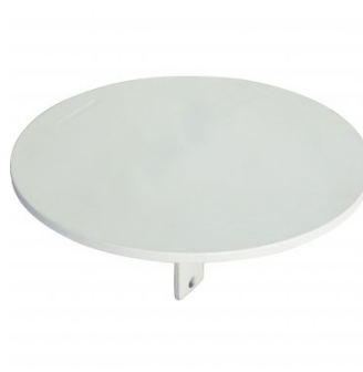
S2240 Round Steel Table for Sand Bag