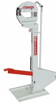
S2266 Foot Operated Shrinker Stretcher - Heavy Duty