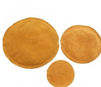
S210 Round Leather Bags - Sand Filled