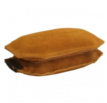
S214 Rectangle Leather Bag - Steel Shot Filled