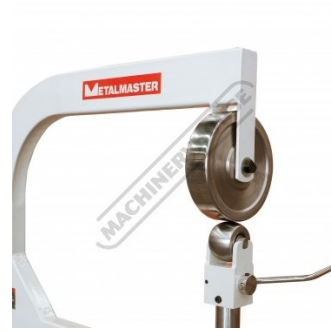
Cam Action Lever Tension