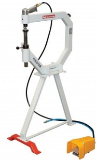
S227A Pneumatic Planishing Hammer