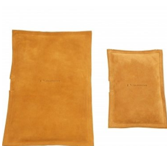
S212 Rectangle Leather Bags - Sand Filled