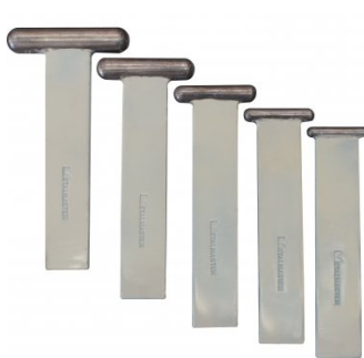
S223 Straight Steel T-Dolly Set Small - 5 Piece