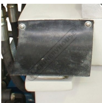
Cross Slide Covers