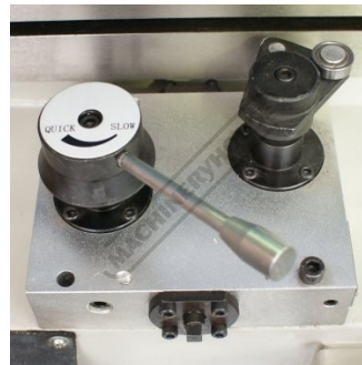
Hydraulic Feed Control