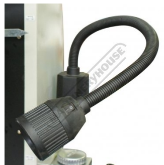
Halogen Work Light