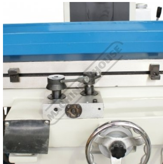
Table Feed Stop System