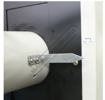
Upper Limit Guide