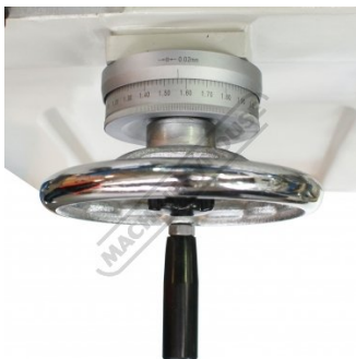
Cross travel Handle 0.02mm graduations