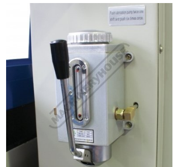
One Shot Oil Lubrication