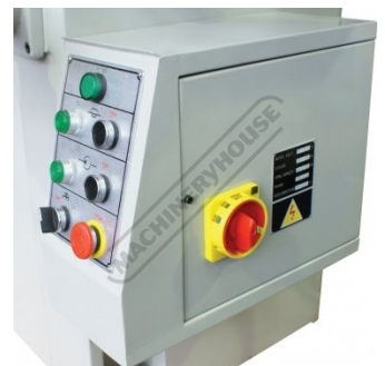
Electrical Box with Stop Switch