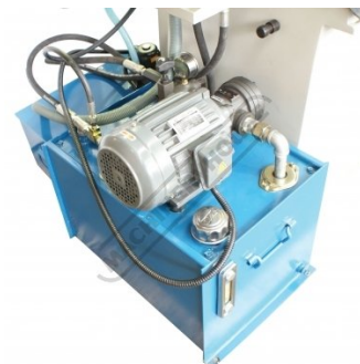
Hydraulic Unit & Coolant Tank