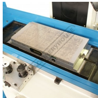
Magnetic Chuck 200 x 400mm