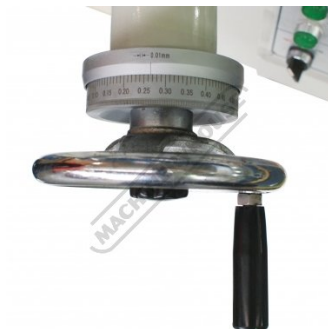
Vertical dial 0.01mm graduations