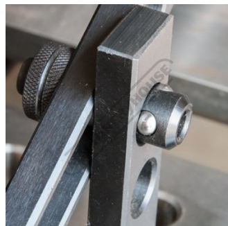
When engaged tightened three steel locking balls move outward to lock underneath the table