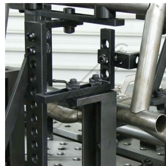
Use Ball Lock Bolts to fasten elements to the tabletop or to economy clamping squares or right angle brackets