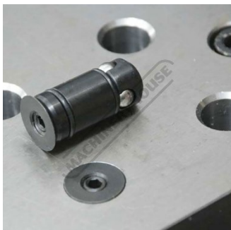
Ball Lock Bolts are an essential component in modular fixturing