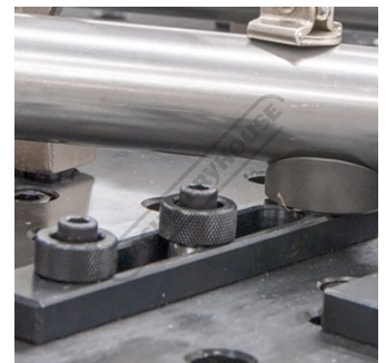
Efficient way of fastening fixture elements