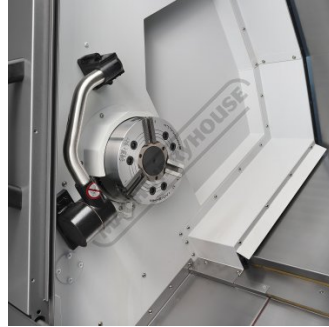
LYNX 2600Y Inside