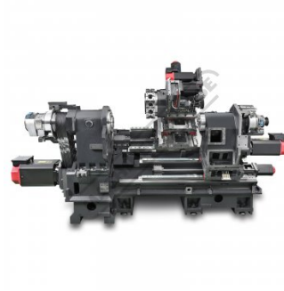
LYNX 2600Y Insert