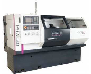
L771 Optimum CNC Lathe