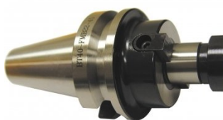
T340 BT30-FMB22-45 Face Mill Arbor