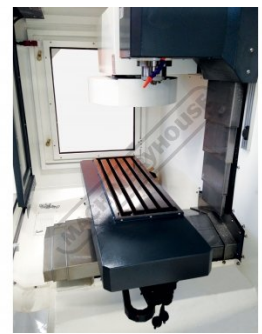
Bed Side View