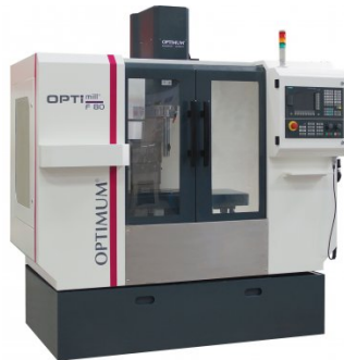
M905 Optimum CNC Milling Machine