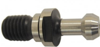
T330 Pull Stud