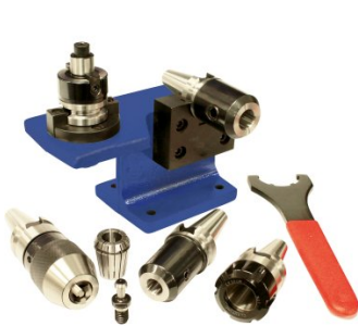
M905T F80TC CNC Mill Starter Tooling Package Deal