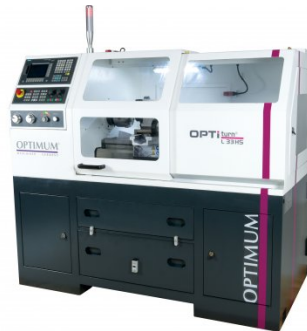
L770 Optimum CNC Lathe