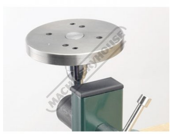
360 Degree Rotation