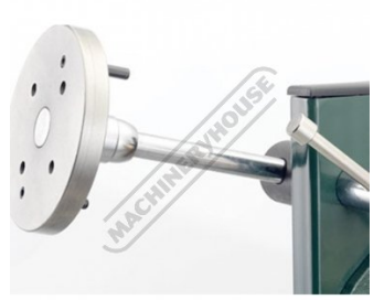
Pivoting Support Arm