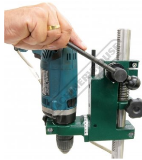
Spring Return Handle Mechanism Action (Hand Drill Not Included)