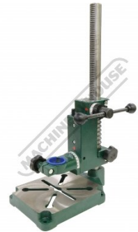
Head Full Down