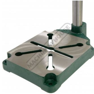
Cast Iron Base