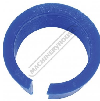
38mm Collar Reducer Insert