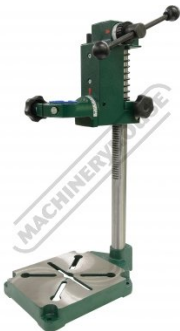
Head Full Up