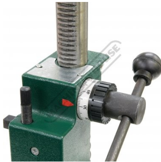
Rack and Pinion Quill Mechanism